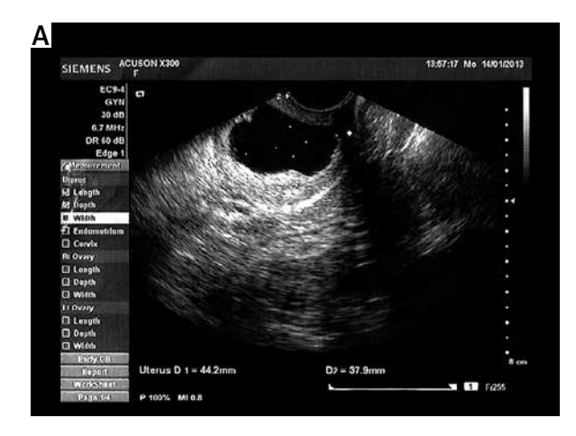
Figure 2. A – Fluid collection in TVS. B – Endometrial lining next to cervical internal os

What is more important, in 34.1% of cases they provided insufficient tissue for diagnosis; however, no hyperplasia or carcinoma was found. In contrast, all specimens collected under vision were pathologically valuable. Thirty-four of 38 hysteroscopic reports of cystic atrophy were confirmed, and neither endometrial polyps, nor hyperplasia and carcinomas, were undetected. In our preliminary study all cases had definitive pathology diagnosis after directed hysteroscopic sampling. We recruited our group according to groups described in the study of Taponeco et al. [4]. So far, it is impossible in our study to compare the hysteroscopic images for patients taking tamoxifen for less or more than 3 years. We decided to divide our patients into these subgroups as it was previously proven that the incidence of premalignant and malignant lesions in postmenopausal tamoxifen-treated patients longer than 3 years was higher compared to those treated for less than 3 years. Taponeco stated that hysteroscopy should be considered as the first diagnostic procedure to perform in tamoxifen-treated postmenopausal patients presenting uterine bleeding and in postmenopausal women treated for longer than 3 years [4].